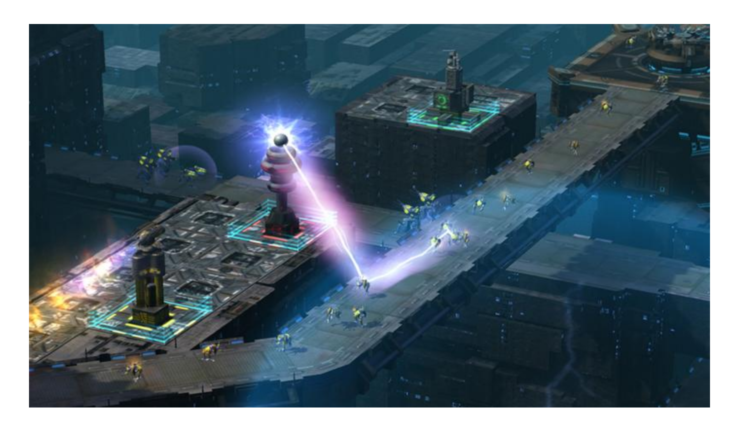
Defense Grid: Resurgence Map Pack 3 Download] [Torrent]